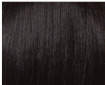
2 Espresso Brown