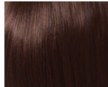
33/30 Chestnut Brown