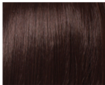
6 Chocolate Brown