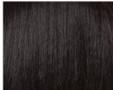
1B Off Black