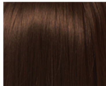
8 Caramel Brown