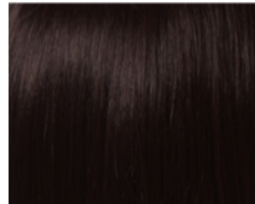
4 Midnight Brown